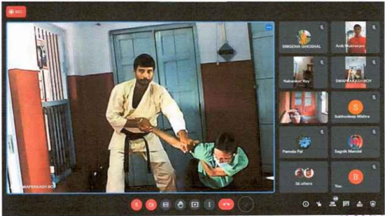
2021 (During Lockdown)