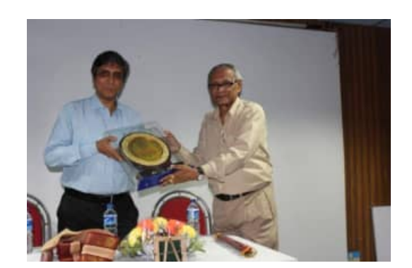
Visit of VC, MAKAUT WB