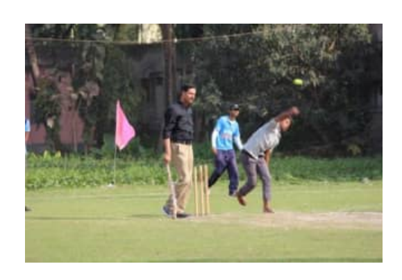
Annual Cricket Tournament 2017