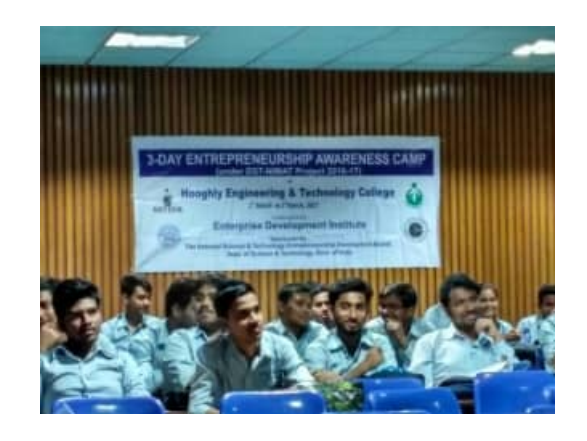
3-Day Entrepreneurship Awareness Camp 2017